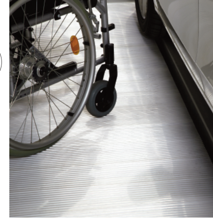
MultiBase 2072i (Parking space for handicapped persons) 🚺